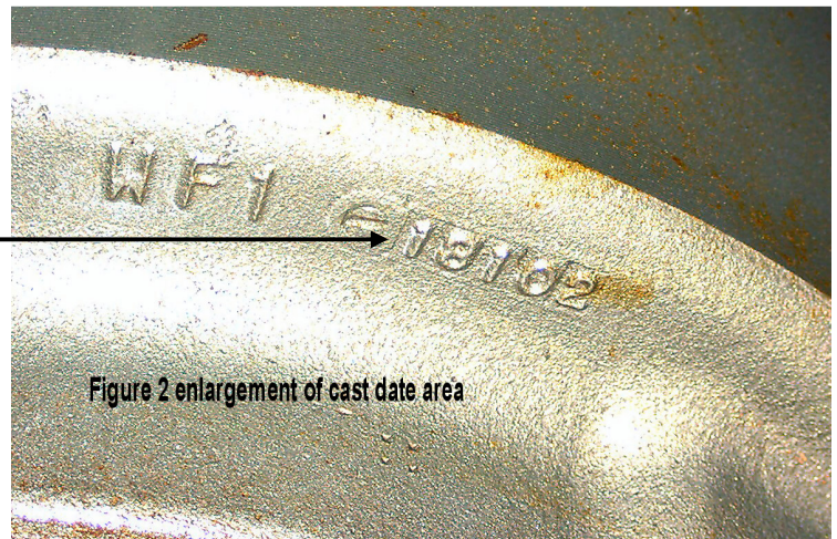
Figure 2 enlargement of cast date area